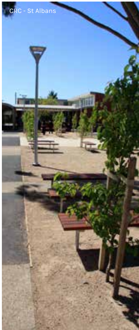
CRC - St Albans