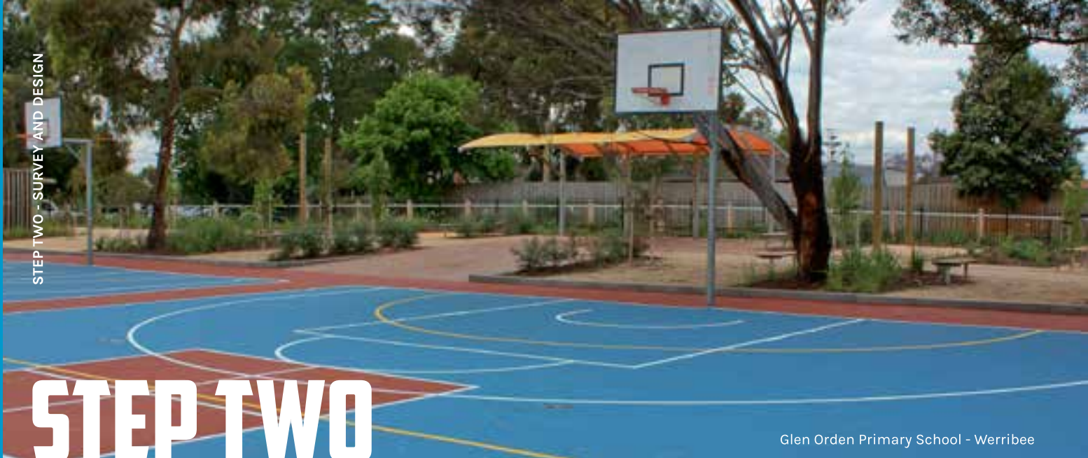
Glen Orden Primary School - Werribee