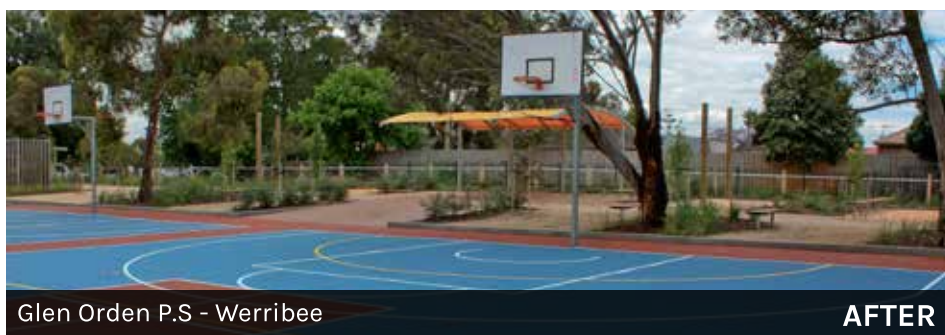
Glen Orden P.S - Werribee