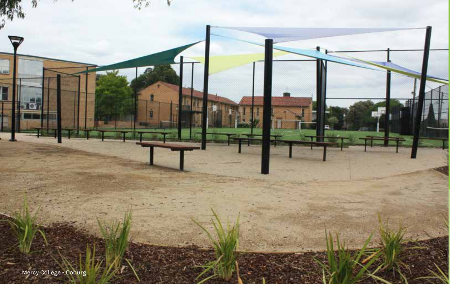
Mercy College - Coburg