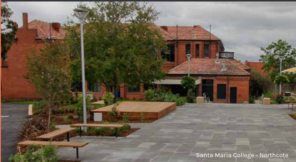
Santa Maria College - Northcote