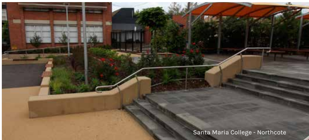
Santa Maria College - Northcote