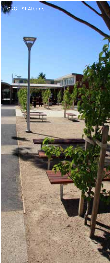
CRC - St Albans

PTA Landscapes will survey the school to compile a drawing of existing conditions; this is an essential element to the design process.