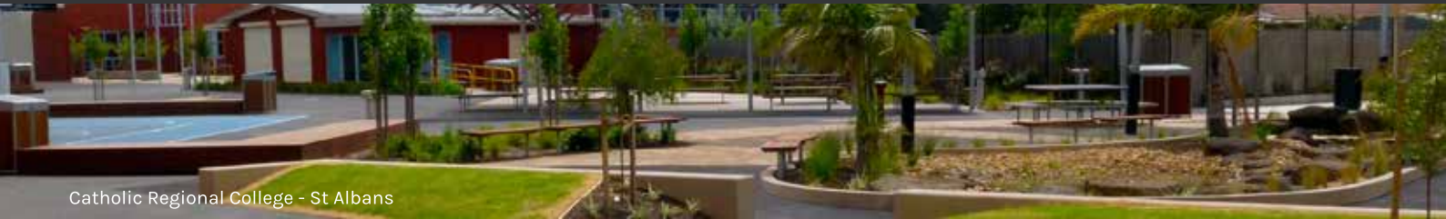
Catholic Regional College - St Albans