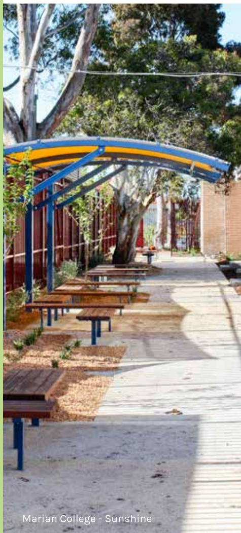
Marian College - Sunshine

On conclusion of the site consultation PTA Landscapes will prepare a fee proposal based on the discussions and requirements as outlined in the consultation.