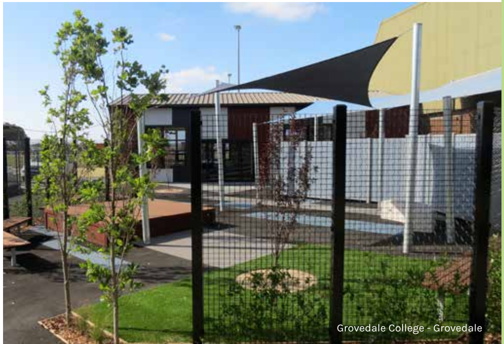
Grovedale College - Grovedale

Depending on your school's stage of development, you may consider having PTA Landscapes complete an external master plan. Master Planning allows you and your school to plan, budget and stage for future works whilst maintaining a consistent style and material palette throughout the campus. Master Planning avoids mismatch of individual projects which do not work in conjunction with one another and ensure a coherent approach. It also allows for the development of areas as stand alone projects that can be staged over several years to fit into budget constraints.