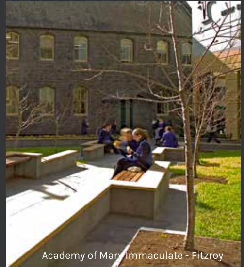
Academy of Mary Immaculate - Fitzroy