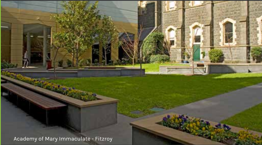
Academy of Mary Immaculate - Fitzroy