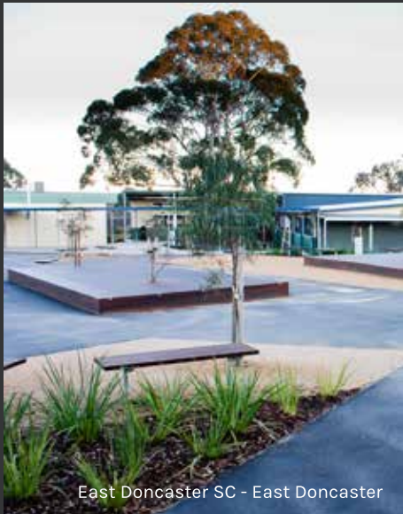
East Doncaster SC - East Doncaster