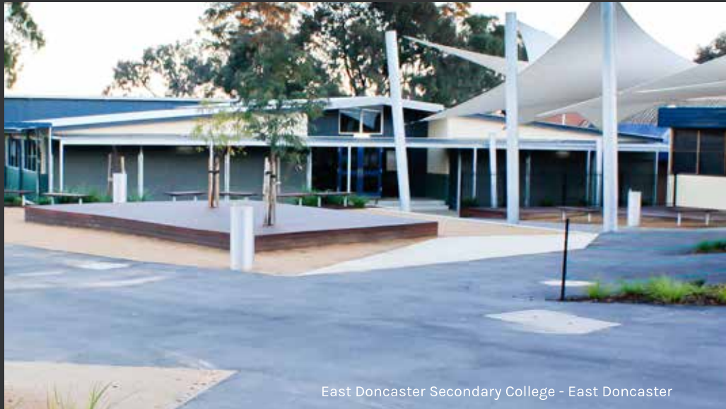
East Doncaster Secondary College - East Doncaster