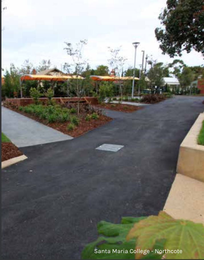
Santa Maria College - Northcote

If your school already has a design master plan - PTA Landscapes are experienced in implementing and constructing from these plans.